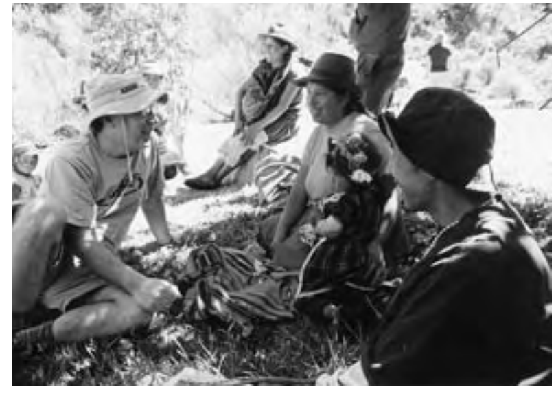
A Culture Xplorers traveler chats with a Quechua villager, after an Earth Offering ceremony.

Just after landing in Luang Prabang I walked along the Mekong river before turning in for a much-needed nap. I brought along my camera looking for atmospheric scenes of river life. When I spotted a wiry, deeply tanned, barefoot man and his wife unloading bundles of firewood from their