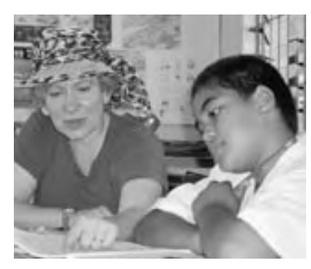
A Global Volunteers senior participating in a Cook Islands literacy project.